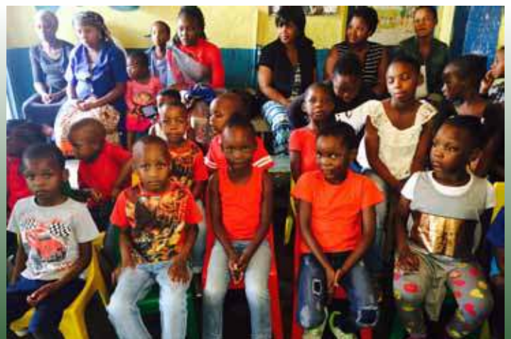
The graduants waiting for the dancers to perform

Eleven little five-year-olds in red T-shirts sat in quiet anticipation; the mothers in their traditional outfits waiting patiently for the sound system to get sorted out; the fathers outside turning copious amount of chicken and boerewors on the braai; and we as visitors were warmly welcomed as we stepped into a busy backyard and inside the small room of St Mary's Crèche to watch the Sigiya Sonke young dancers entertain the children's Graduation to Grade 1. This was their very first performance and Jack was very proud of them.