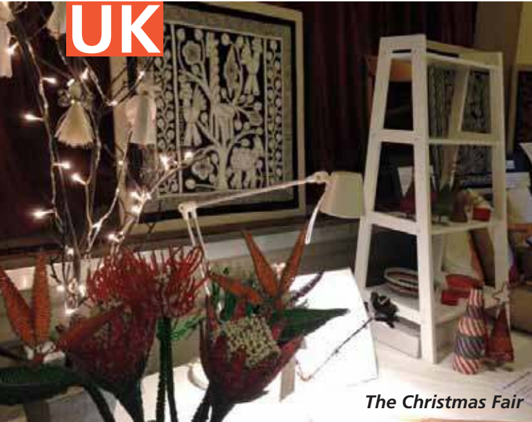
The Christmas Fair