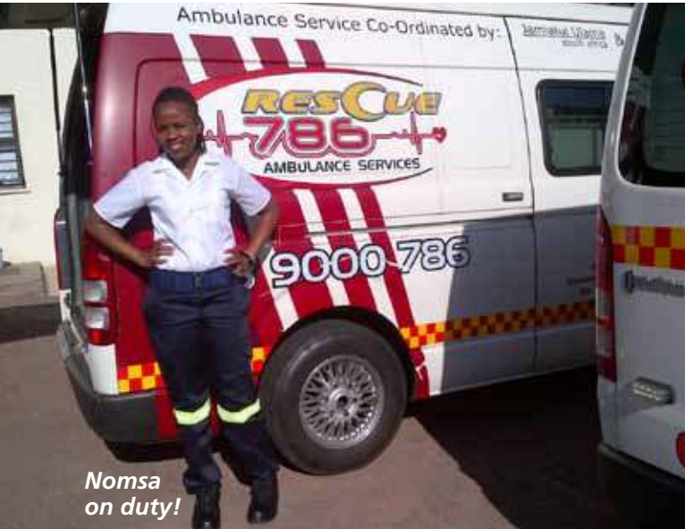
Nomisa on duty!